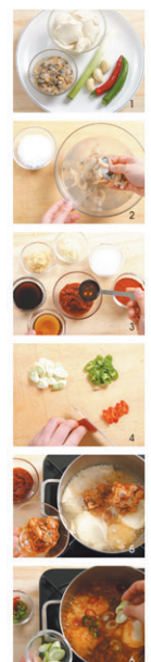
Sundubu-jjigae is a stew of soft tofu and clams in a spicy broth. Soft tofu is made with soaked soybeans which are called "beef from the garden". It is soft and sweet in taste. From olden days, Koreans developed tofu making skills and various dishes with tofu.